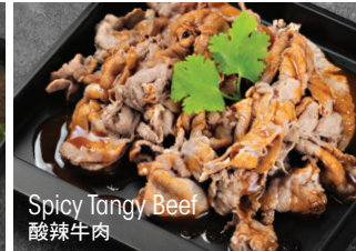
Spicy Tangy Beef 酸辣牛肉