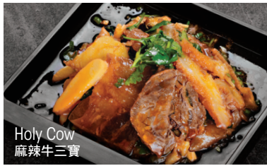
Holy Cow 麻辣牛三寶