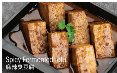
Spicy Fermented Tofu 麻辣臭豆腐

食材會因季節的不同而有所調整，恕不另外通知。Ingredients vary by season.