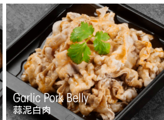
Garlic Pork Belly 蒜泥白肉