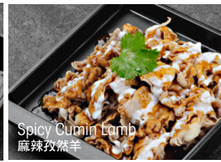
Spicy Cumin Lamb 麻辣孜然羊