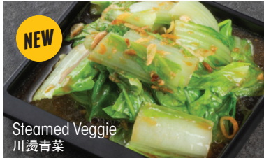
Steamed Veggie 川燙青菜