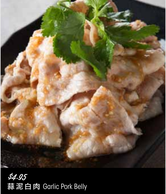
$4.95 蒜泥白肉 Garlic Pork Belly