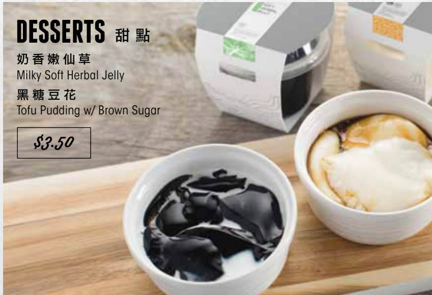
DESSERTS 甜點 奶香嫩仙草 Milky Soft Herbal Jelly 黑糖豆花 Tofu Pudding w/ Brown Sugar $3.50