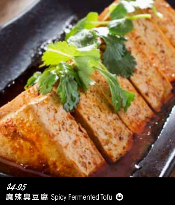
$4.95 麻辣臭豆腐 Spicy Fermented Tofu 🍵

10 THAI FUSION 南洋風味鍋 Cabbage, Taro Stem, Sliced Pork, Enoki Mushroom, Cuttlefish Ring, Fuzhou Fish Ball, Clam, Crab, Baby Octopus, Organic Bunashimeji Mushroom, Shrimp, Cilantro. 高麗菜, 胡夢, 豬肉片, 金針菇, 花枝圈, 福州魚丸, 蛤蜊, 螃蟹, 小章魚, 大蝦, 有機鴻喜菇, 香菜。 NEW FLAVOR 新口味 南洋風味湯底小辣 Mild to Flaming Spicy