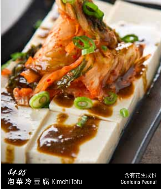
$4.95 泡菜冷豆腐 Kimchi Tofu 含有花生成份 Contains Peanut