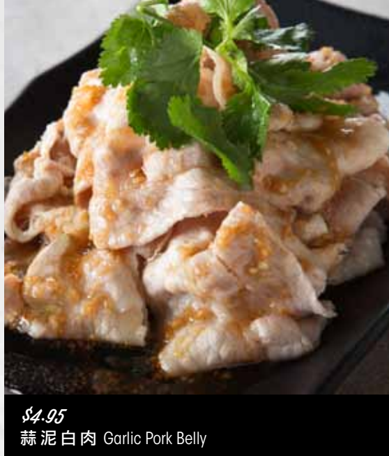
$4.95 蒜泥白肉 Garlic Pork Belly