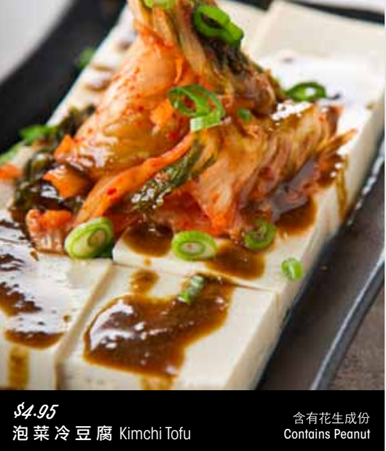
$4.95 泡菜冷豆腐 Kimchi Tofu 含有花生成份 Contains Peanut